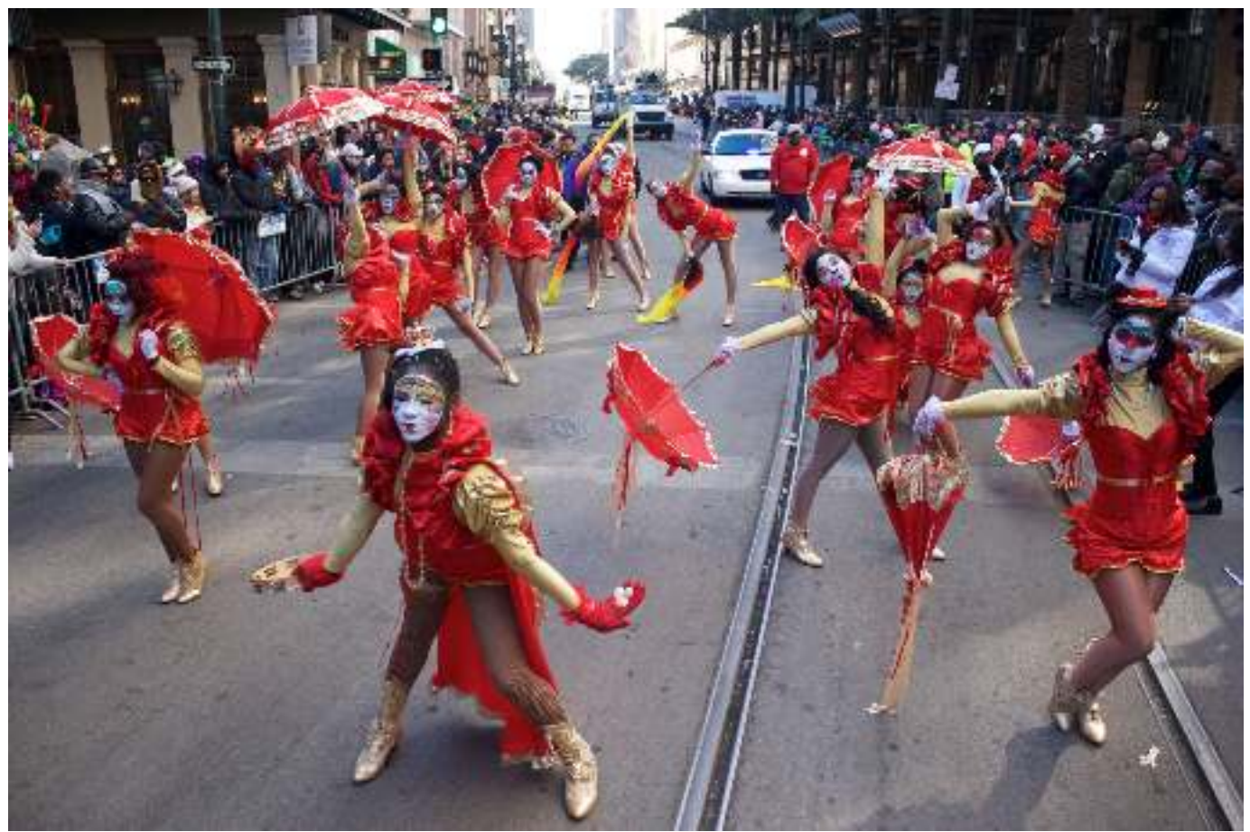
The New Orleans Baby Doll Ladies' Mardi Gras Day, Walking-Parade; 2/9/2016